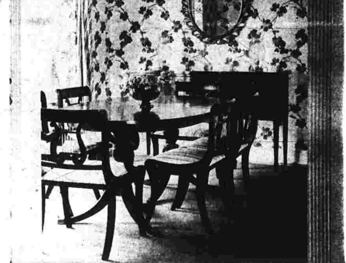
Green and white is the color scheme of the Life House dining room with green by-pattered paper on a white ground, green textured broadloom rug, green and white striped draperies and chair seats. Even the toilet lighting is green with white stripings. 1940 furniture of similar scale than usual lends an airy effect to the room.