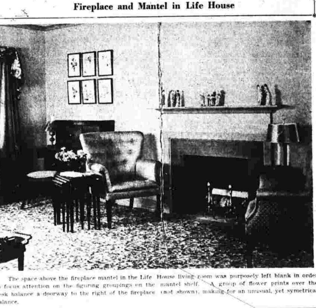
Fireplace and Mantel in Life House

Bath Watkins, decorator of the pair of chairs before the fireplace and in the striped sofa. The draperies are also in this room and they will be on hand to add a more formal touch to the room. The wing chair and lamp have been selected to give a sense of harmony with the wall. The Eighteenth century rug contains the entire color scheme of the room and the soft color scheme for the rest of the house.